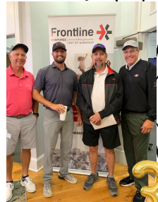
"The Tee Amigos"